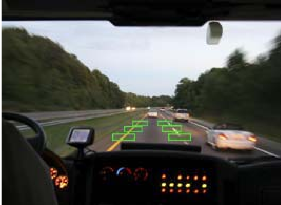
Figure 1 – Camera Position in Vision-Based LDWS. Observe the position of the camera in the top-right corner behind the windshield of the vehicle and the lane markings it is currently detecting (as indicated by the green rectangles along the yellow lane marking) ahead of the driver’s current position.

This lane-marking range is then used to determine the lateral position of the vehicle in the current lane. Depending on the current speed and overall motion of the vehicle, the LDWS estimates the time it would take the vehicle to cross the lane boundaries. If this time parameter, often known as the time-to-lane-cross (TLC), exceeds a predefined threshold, an audible, vibratory, and/or visual warning alarm is sounded.